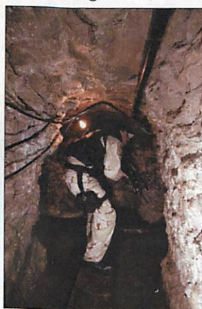
HSI Special Response Team Securing a Tunnel Access

The San Diego Tunnel Detection Outreach is a community outreach and enforcement initiative developed by the San Diego Tunnel Task Force, a coop-